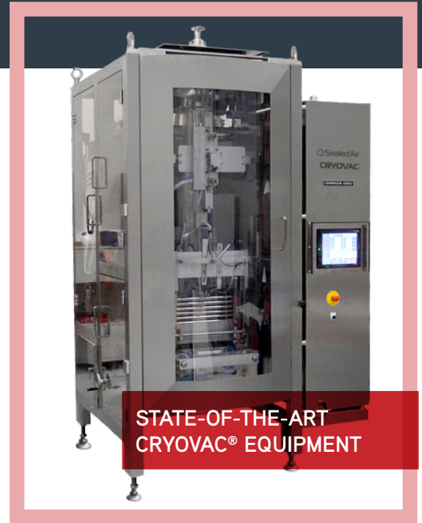
STATE-OF-THE-ART CRYOVAC ® EQUIPMENT