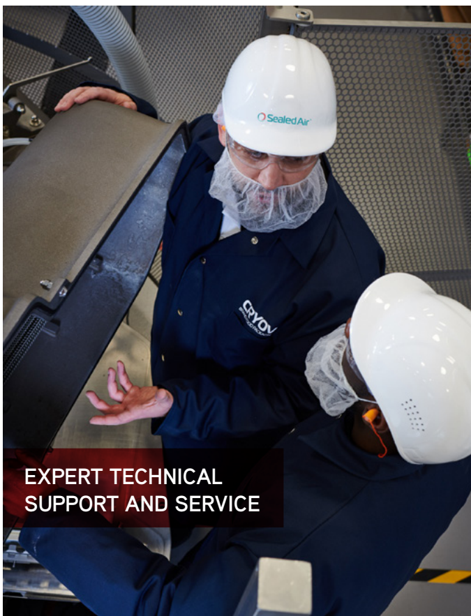
EXPERT TECHNICAL SUPPORT AND SERVICE