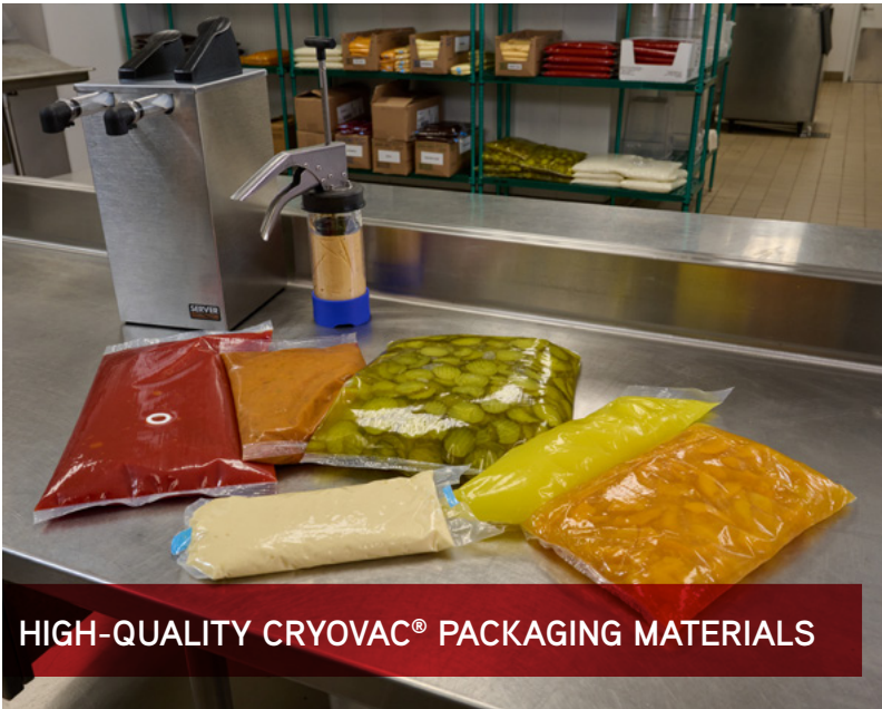
HIGH-QUALITY CRYOVAC ® PACKAGING MATERIALS

Take advantage of CRYOVAC ® comprehensive liquid packaging solutions, offering a seamless blend of materials, equipment, services and dispensers.