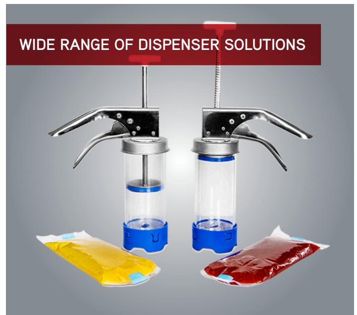
WIDE RANGE OF DISPENSER SOLUTIONS

Designed to meet the needs of food service providers and food processors alike.